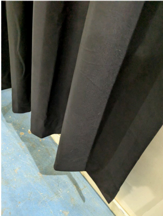
Figure 2 – Detail of specimen materials